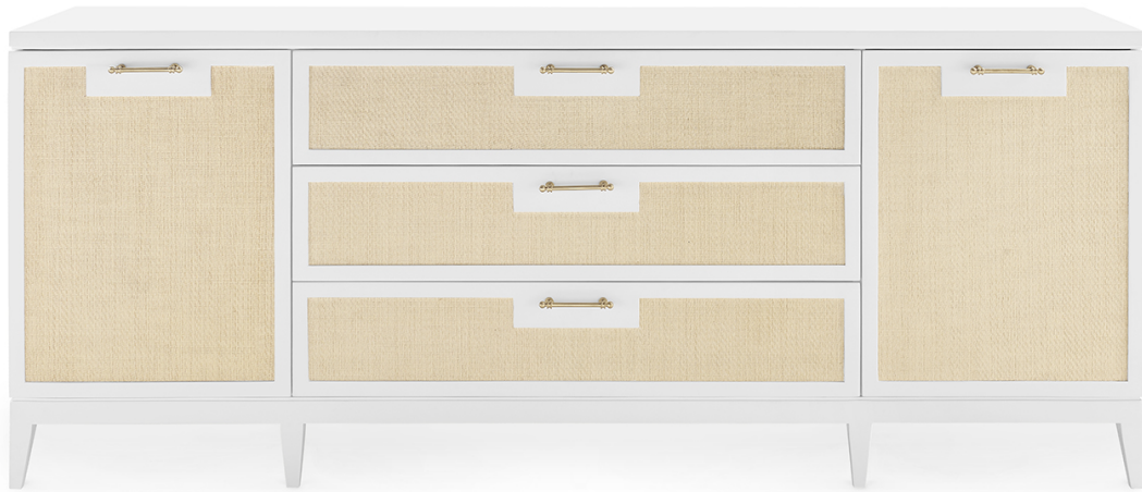
ASTOR 3-DRAWER & 2 DOOR CABINET, WHITE