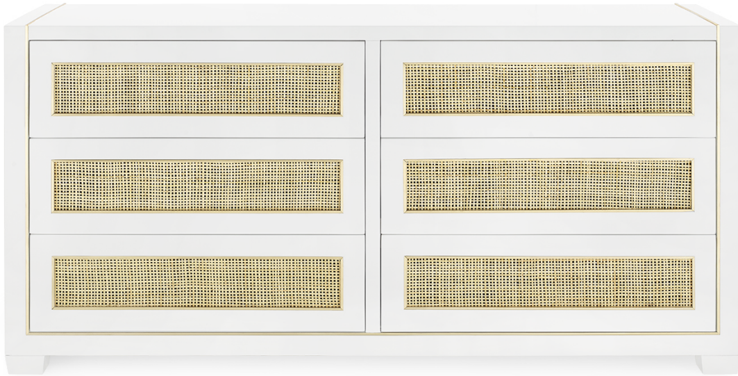
KAREN EXTRA LARGE 6-DRAWER, WHITE