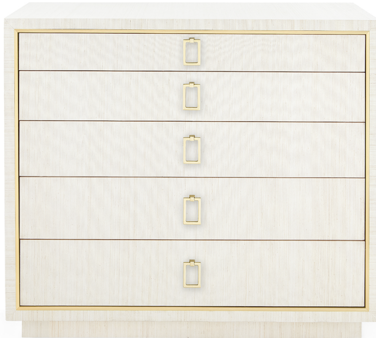
PARKER LARGE 5-DRAWER, LIGHT NATURAL