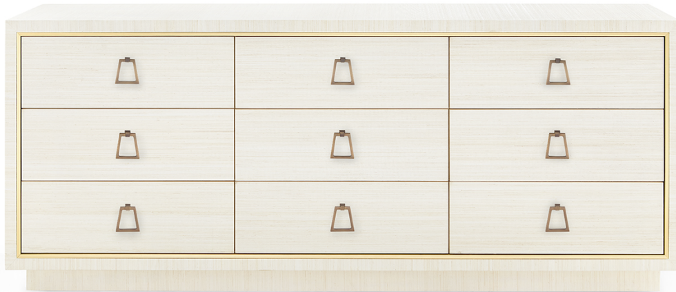
PARKER EXTRA LARGE 9-DRAWER, LIGHT NATURAL